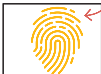
LEFT INDEX FINGER

If either finger is injured, provide the impression of another finger, but clearly designate which fingers were used for the rolled impression.