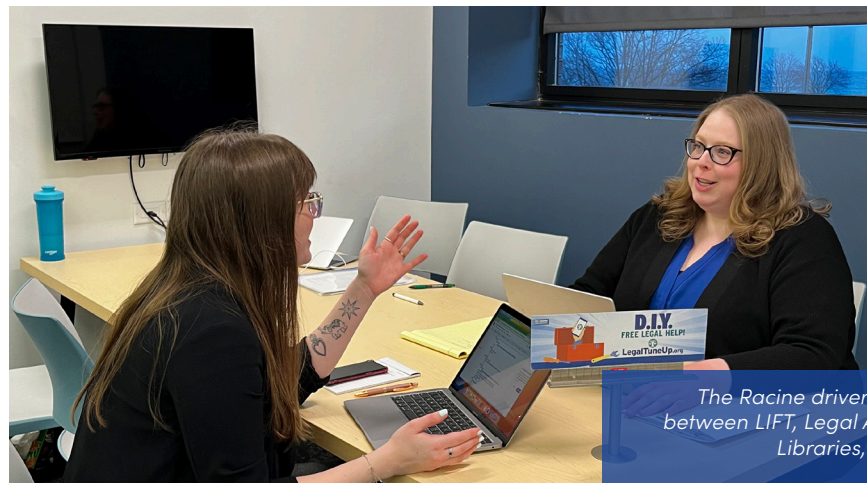
The Racine driver's license clinic is a partnership between LIFT, Legal Action of Wisconsin, Racine County Libraries, and the city of Racine.

LIFT is working to transform the civil legal system for those who cannot afford to address legal issues that are exacerbating their economic insecurity. We are working to expand justice by making the system more accessible, by advocating for increased investment in civil legal aid services, and educating individuals and communities on the importance of addressing civil legal issues to mitigate poverty. Without ongoing and comprehensive change to our justice system we will continue to trap people in a maze of overwhelming, intimidating and expensive circumstances far afield from our collective vision of justice.