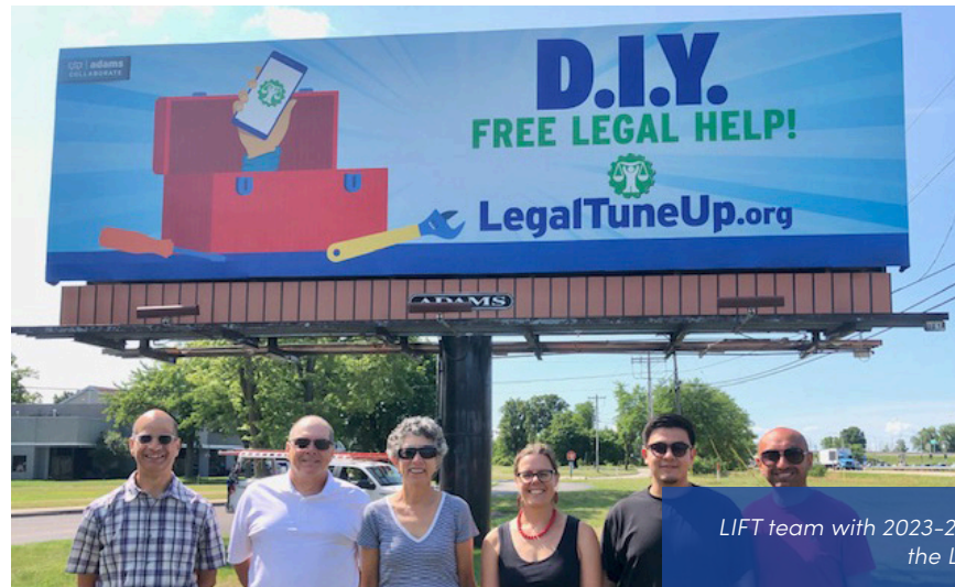
LIFT team with 2023-2024 billboard campaign promoting the Legal Tune Up tool

Our 2024 ambitions include continuous improvement to our Legal Tune Up tool, growing our network of legal navigators, expanding our legal clinic offerings and increasing our advocacy efforts.