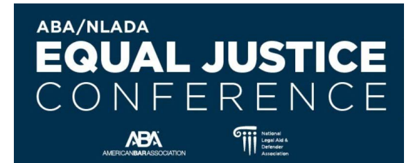
EJC conference in San Francisco - 5/27