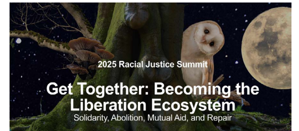
YWCA's Racial Justice Summit with Judicare - 1/25