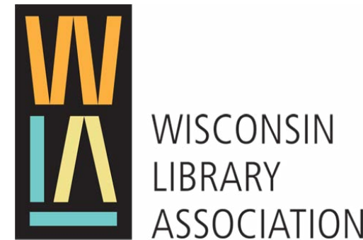
WLA Fall Conference - 5/25