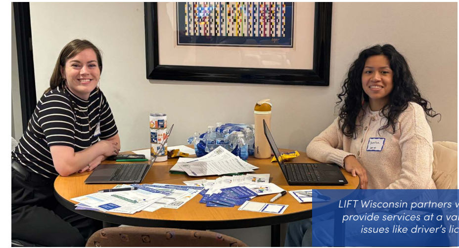
LIFT Wisconsin partners with Legal Action of Wisconsin to provide services at a variety of clinics, assisting in legal issues like driver's licenses, evictions, and more.