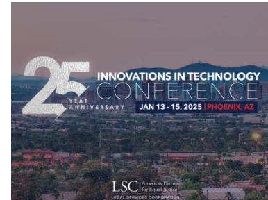
LSC's Innovations in Technology Conference in Phoenix - 1/25